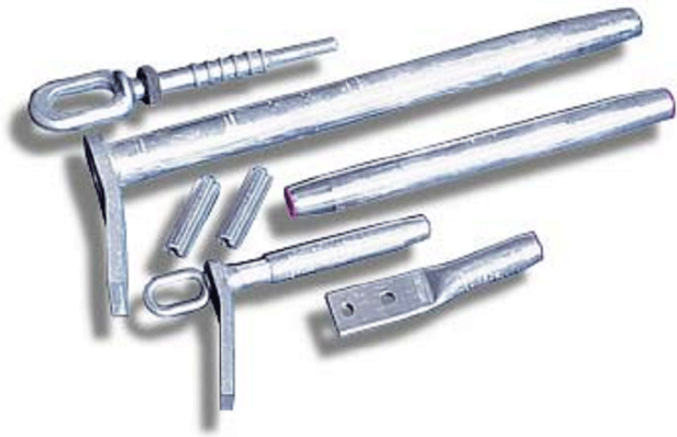
Figure 1: ACA Compression-Type Hardware

The compression-type hardware from ACA uses a modified two-part approach. One part grips the core, and then an outer sleeve grips the aluminum strands, as shown in Figure 1. This approach is similar to the approach used with ACSS, although modified to prevent deformation, notching, or bending of the core wires. The gripping method ensures the core remains straight to evenly load the wires, and also ensures that the outer aluminum strands suffer no lag in loading relative to the core.