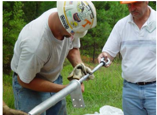
Figure 3: ACCR Larger Outer Sleeve, which Is Similar to Conventional Conductor Accessories

3M provides all the accessories necessary for the installation (dead-ends, suspensions, come-along, compression dies, inhibitor compound, and vibration dampers), unless you prefer to order them from PLP or ACA directly. In that case, 3M will assist AEP in determining and specifying the appropriate accessories for the installation. 3M will also provide roller array sheaves that will be available for the duration of the installation where necessary.