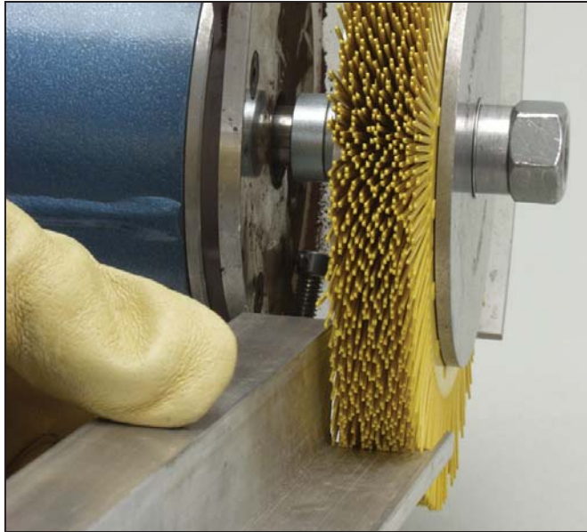
8" Deburring Aluminum Extrusion

Application Description: Bench Motor Deburring